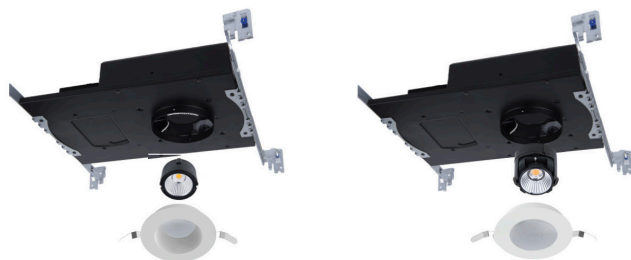
Round Downlight Trim Shown